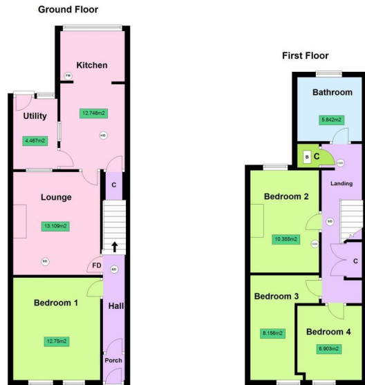
18 Mayfield Road, Bath