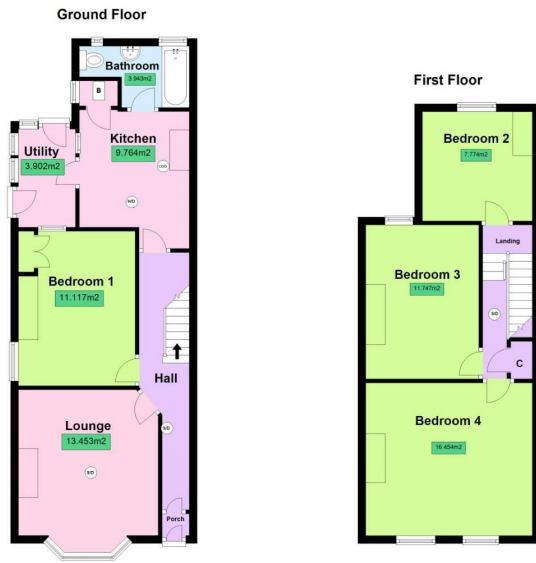
21 King Edward Road, Bath