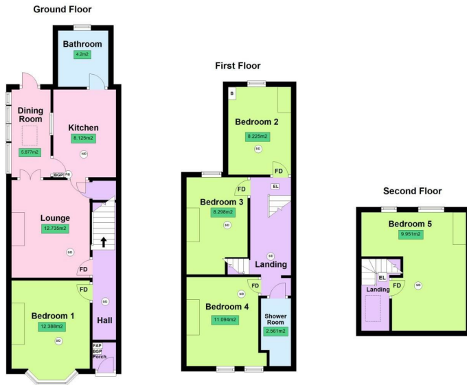
53 Coronation Avenue, Southdown, Bath