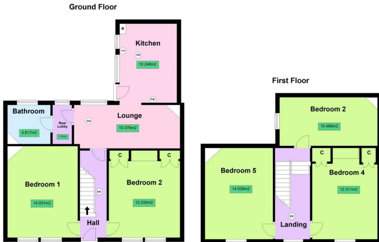
3 Lorne Road, Bath