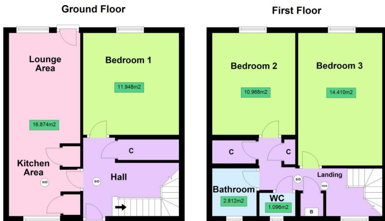
16 Durley Park, Bath