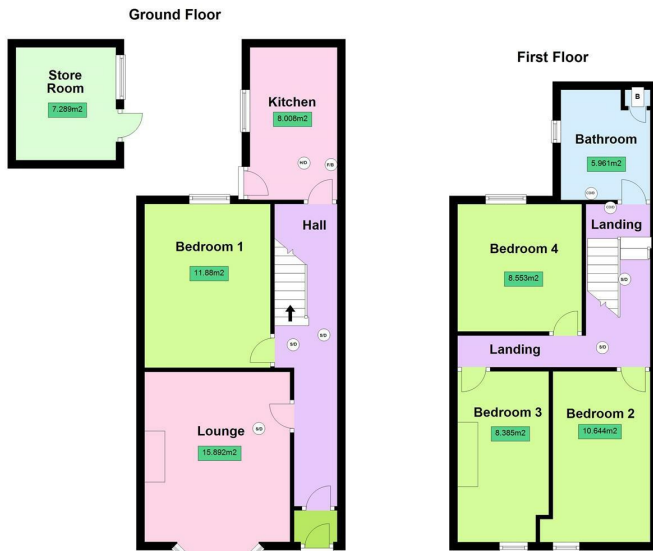
39 Lorne Road, Bath