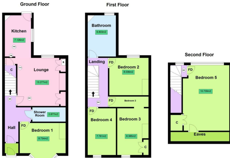
36 Lorne Road, Bath