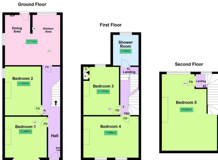
1 Vernon Park, Bath