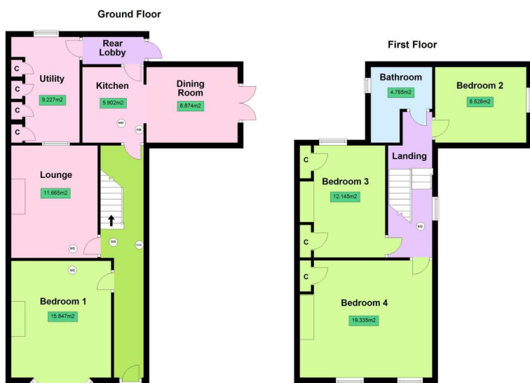
40 Lorne Road, Bath