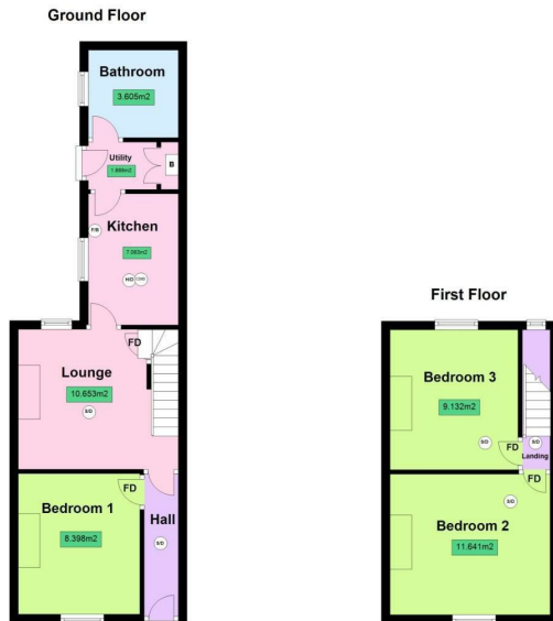
23 South View Road, Bath